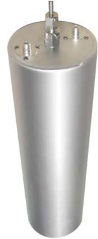
JAG-BPF-161-07-1 Shown for illustration

The JAG-BPF-161-07-1 Band-Pass filter is comprised of a 7-inch aluminum extrusion cavity with internal silver-plated tuners to maintain a relatively high Q and low loss. The JAG-BPF-161-07-1 is equipped with adjustable coupling loops that allow easy field adjustment of insertion loss and selectivity (see curve above).