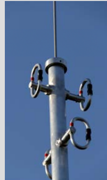
Optional lightning rod