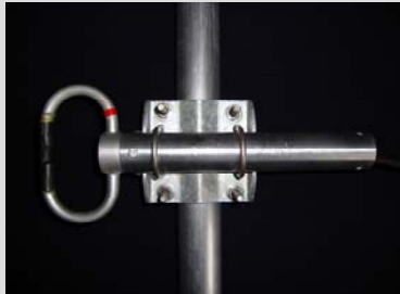
1/4 - wave spacing (3.5 – 4.2 dBd gain) (Offset pattern)

Note: Only one of the dipoles out of the 2 bays is shown here for illustration purposes. Gain values below represent complete antenna (not a single dipole).