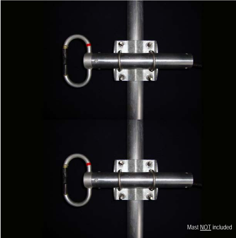
Mast NOT included