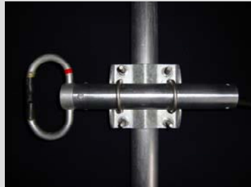
1/2 - wave spacing (3 – 3.7 dBd gain) (Bi-directional / Elliptical pattern)