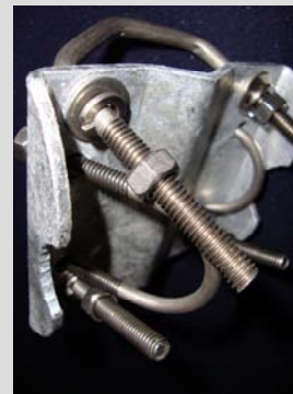
Heavy-duty galvanized clamp w/S.S. hardware