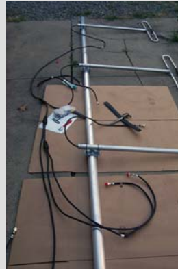
Assemble onto user-supplied mast