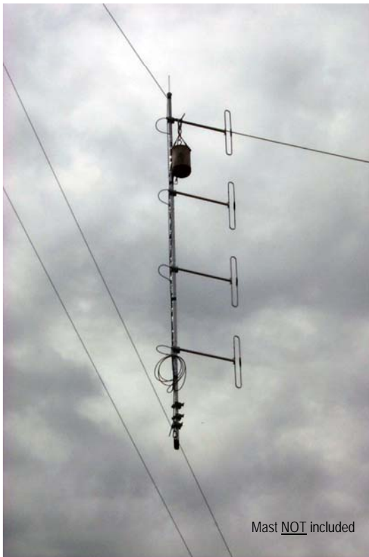
Mast NOT included