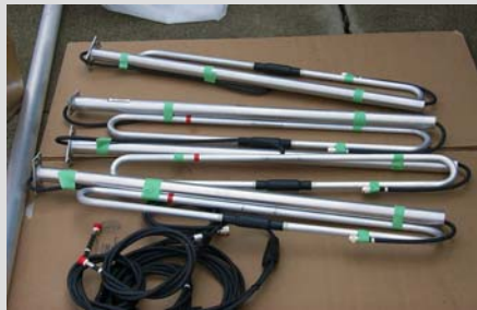
Antenna unpacked and ready to assemble