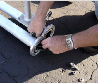
Undo transport bolts