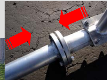
Install S.S. hardware

*Site-specific mounting hardware is necessary with these antennas. Please consult JAG to determine suitable clamps for your application.