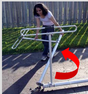
Swing out top element