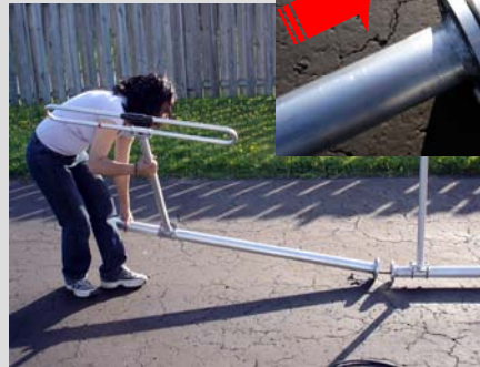
Align dipoles and join sections according to desired pattern