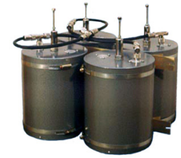
JAG-PRD-460-07-4-RM Shown for illustration

The JAG-PRD-460-07-4-RM four-cavity band-pass/band-reject duplexer is comprised of 7-inch aluminum cavities with internal silver-plated tuners to maintain a very high Q and low loss. As a consequence, the JAG-PRD-460-07-4-RM provides isolation in excess of 80dB at frequency separations of 2 MHz or greater.