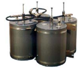
JAG-PRD-460-07-4-RM Shown for illustration

* This is a general representation of this model's frequency response.