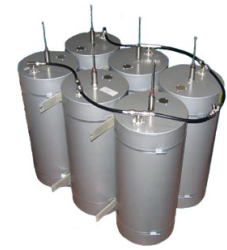
JAG-PRD-161-10-6-RM Shown for illustration

* This is a general representation of this model's frequency response.