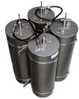
JAG-PRD-161-10-4-RM Shown for illustration

* This is a general representation of this model's frequency response.