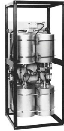
JAG-CFC-455-10-8-OF Shown for illustration

* This is a general representation of this model's insertion loss.